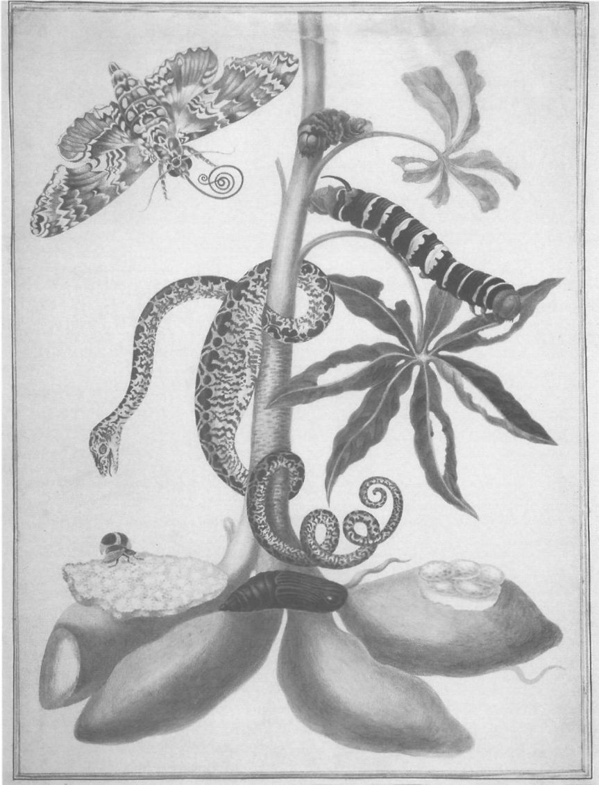
Figure 1. Reproduction of the original water-colour on vellum for plate 5 of Metamorphosis Insectorum Surinamensium present in the Windsor library. Caterpillar and moth of Manduca rustica (Fabricius) on the cassava, Manihot esculenta Crantz. Merian added the garden tree-boia Corallus enhydris (L.) to complete the decoration of the plate. (Reproduced from the original drawing owned by Her Majesty The Queen; copyright The Royal Collection.)

Jonas Witsen, Secretary of the city of Amsterdam and his brother Nicolaas Witsen, burgomaster of the city, who was one of the last encyclopedic collectors in Holland, had a high regard for her talent. After her return, some of the specimens she collected and some of her drawings were on display for a while in the town hall of Amsterdam (Kerner, 1992: 116).